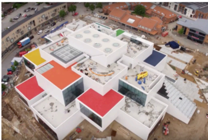
Video released of BIG's Lego House in