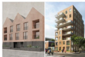
Plans lodged for two Hackney Council housing schemes