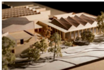
Design Engine lodges plans for Winchester College revamp